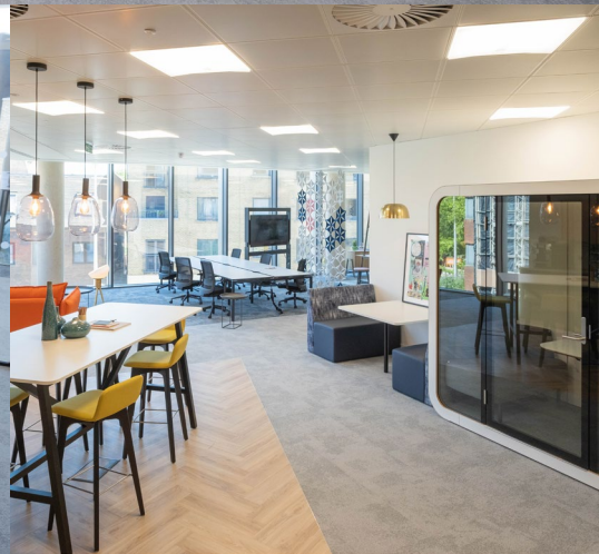
Images of Suite 1