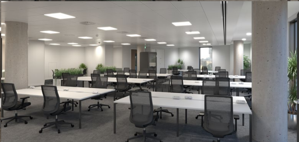
CGIs of Suite 2